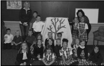
Our 1st Graders made a fall tree pattern quilt and pillow sham.

The Sailing into the Future event has charted a course for success! Cruise over to the Prom Center on November 12th, 2011 and join the Presentation community in a night of excitement.